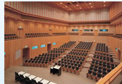
International Conference Hall (Plaza Heisei 3F)